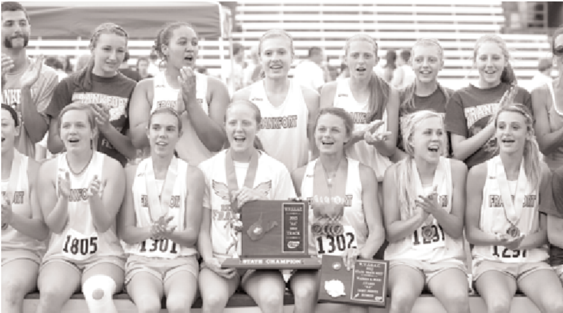
The Frankfort Lady Falcons sing the school fight song from the podium at the state track meet in Charleston on Saturday afternoon. The title is the second in school history for FHS and the first won by a girls' team. For many more photos from this weekend's meet, see page 9, or the upcoming Frankfort Beacon.

COACHES: Send your scores and photos to sports@newtribune.info or mminnich@newtribune.info or call (304) 788-3333, Ext. 110. Please leave a message.